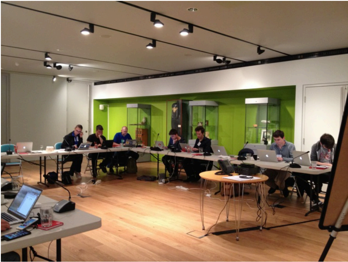
Figure 2 — The interoperability test event at The Higgins , with attendant Sarcophagus