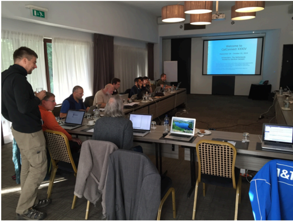
Figure 2 — Just prior to opening CalConnect XXXIV on Wednesday