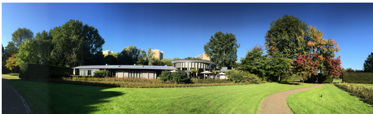
Figure 1 — The Rosario in Amsterdam, venue for CalConnect XXXIV