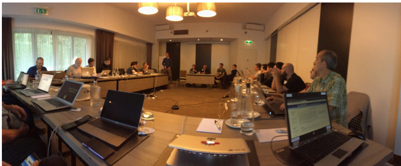
Figure 4 — Panel discussion Wednesday afternoon at CalConnect XXIV